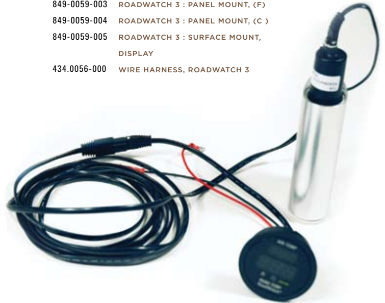
ROADWATCH® SS ▲