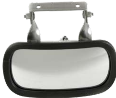
MX409 8.76" X 4.63" RECTANGULAR CONVEX MIRROR